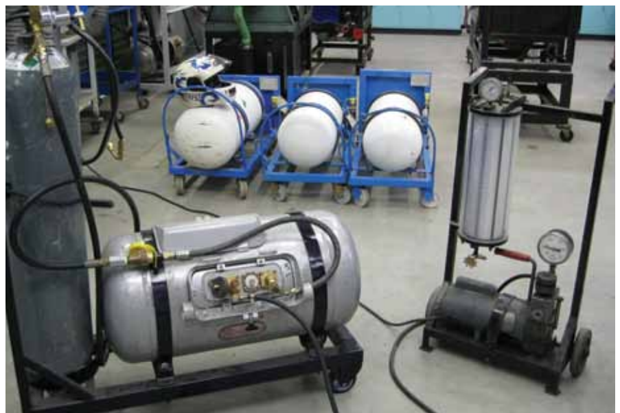
Apparatus in foreground for pumping out LP Gas containers using applied pressure method

Polytechnic West is proposing to conduct courses on a three day block basis at their Carlisle Campus. The contact person at Polytechnic West for starting dates and details of courses is Amanda Dowling, phone 9374 6111 on Monday to Wednesday, 9267 7425 on Thursday or email amanda.dowling@polytechnic.wa.edu.au .