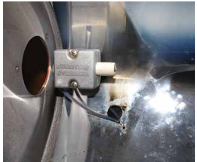
Photograph of faulty lighting fitting showing phase to earth fault and no protection for the cable where it passes through the reflector.

The two towers (towers 1 and 2) installed near the sporting club rooms were supplied from a 63 ampere Type D ACB and earthed by running earthing conductors. The two towers (towers 3 and 4), furthest from the clubrooms, were also protected by a 63A Type D ACB but each were earthed by an electrode instead of a running earthing conductor. The lighting fittings in both these towers had phase to earth faults and, due to the high earth resistance, were 'live' with a small current flowing to earth.