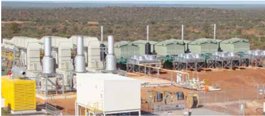
View of the three gas turbines and four gas engines at Windimurra Vanadium Mine Process Plant