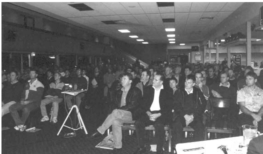
Electrical industry operatives attending a seminar at the Ascot Racecourse