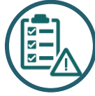
Conduct a risk assessment