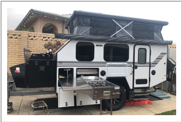
Figure 3 - Example 2 of slide out kitchen.