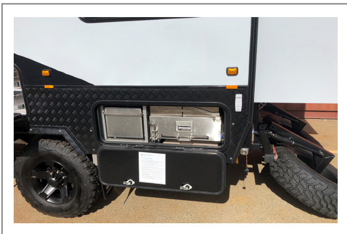
Figure 5 - Example 4 of a cooker in its stowed position.

Disclaimer – The information contained in this fact sheet is provided as general information and a guide only. It should not be relied upon as legal advice or as an accurate statement of the relevant legislation provisions. If you are uncertain as to your legal obligations, you should obtain independent legal advice.