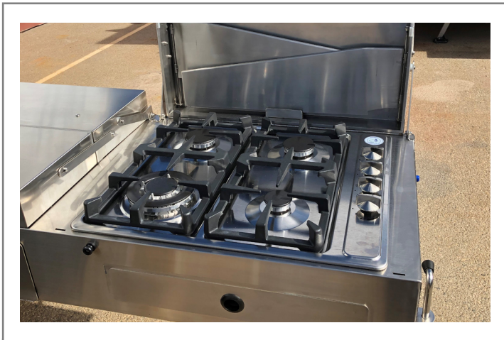
Figure 4 - Example 3 of slide out cooker.