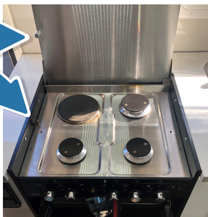
Figure 1 – A typical acceptable 'form of interlock'.