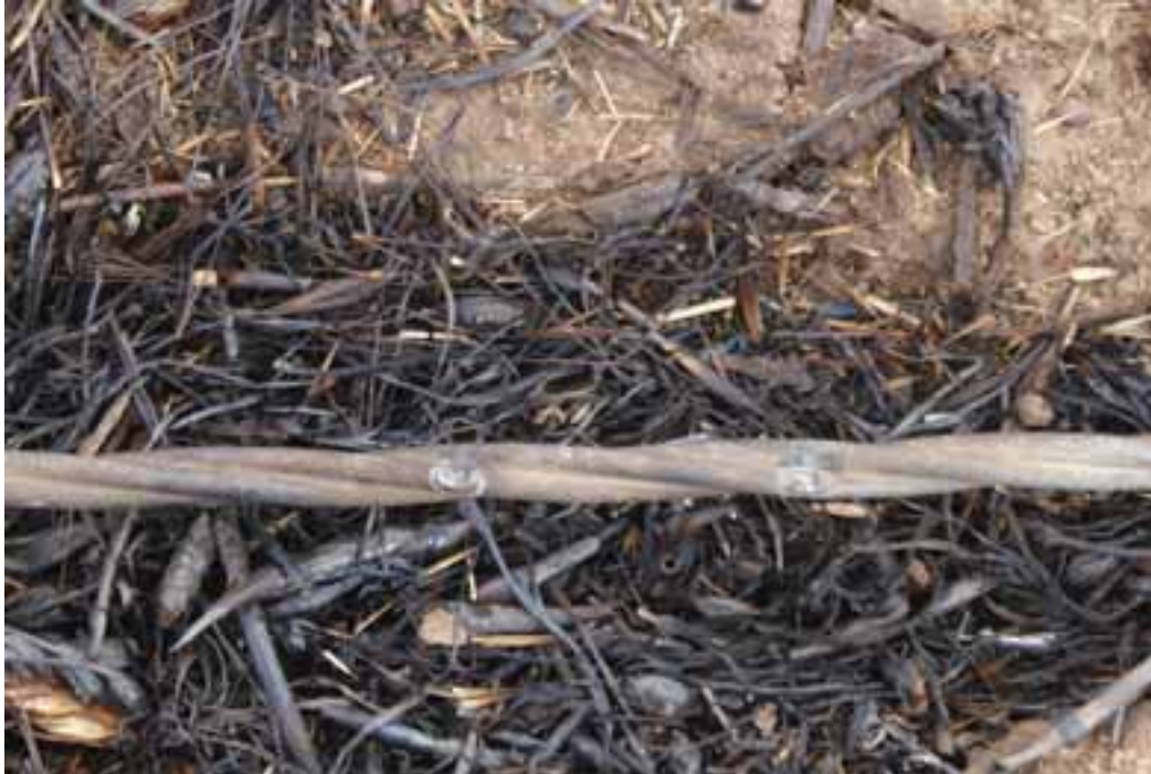
Arc Marks at 14 Metres.

The investigation identified arc marks (melting of the steel) on the active and earth return conductors 9 metres and 14 metres out from Pole T303-43 towards pole T303-42. The arc marks at 14 metres were recent. The marks 9 metres from the pole were old.