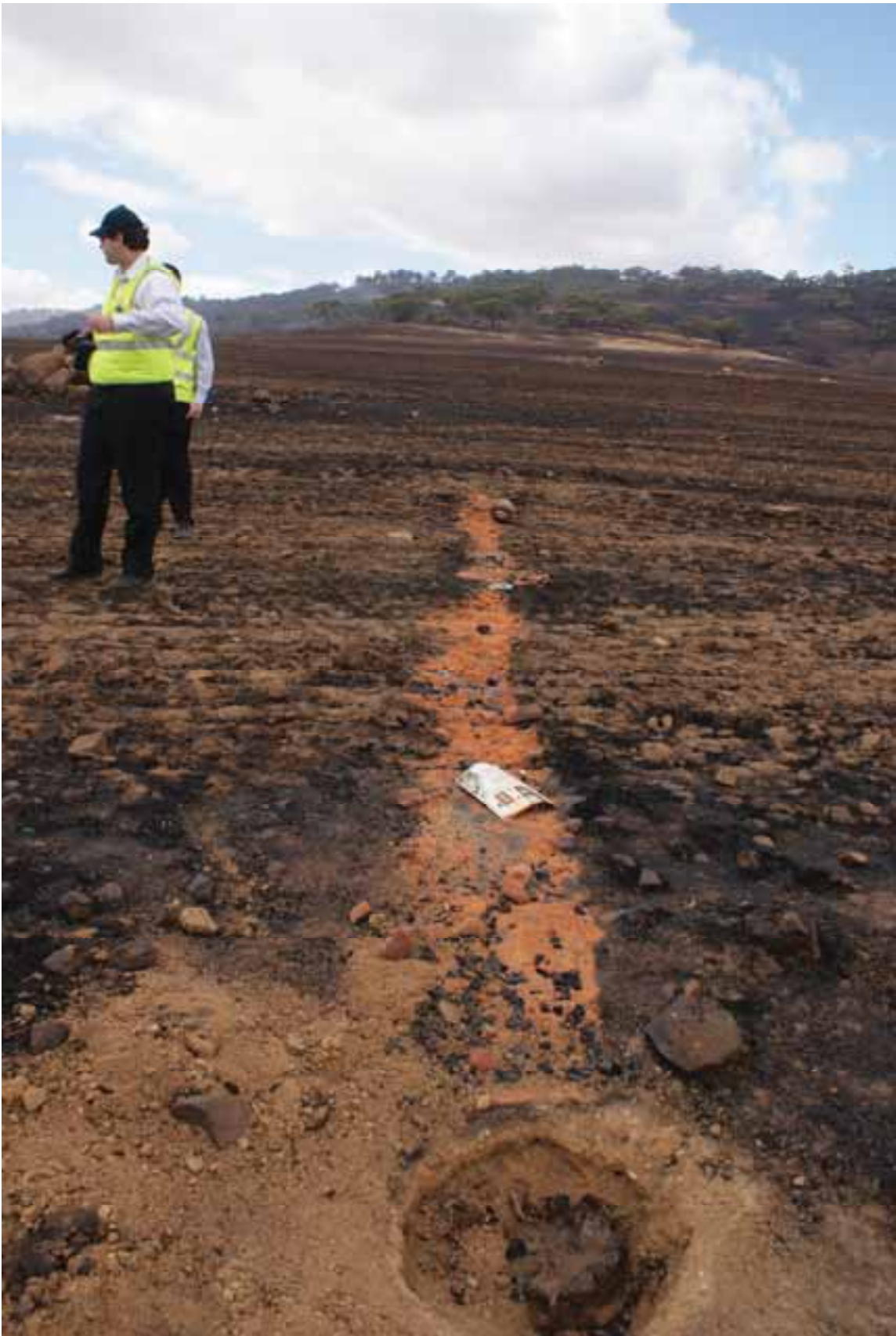
Remains of Pole T303-43. Photograph taken by Energy Safety on 30 December 2009