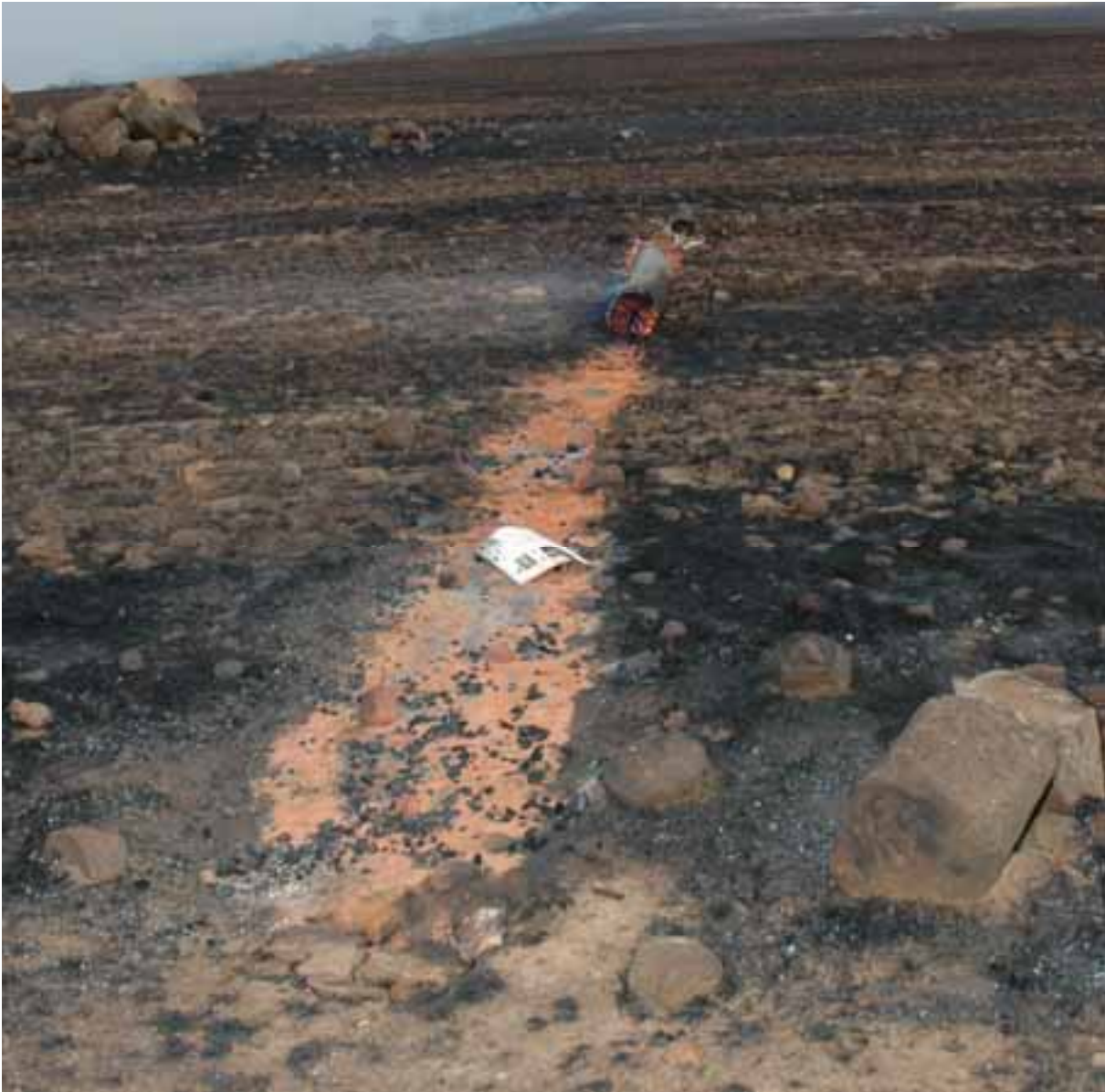
Remains of Pole T303-43. Photograph taken by FESA on 29 December 2009

Pole T303-43 was also burning near the ground and then fell to the ground and continued to burn until it was completely consumed. Marks on the ground confirm that the earth return conductor then broke at Pole T303-43 and pulled away from the pole (after it was consumed by the fire).