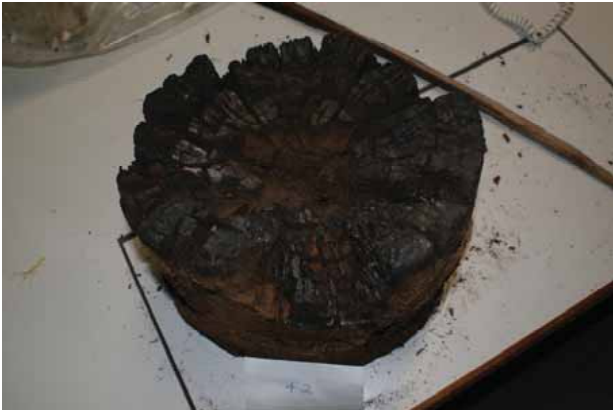
Top of pole butt T303-42

The area of origin was disturbed by FESA and Police during fire scene investigation activities, as well as by necessary measures taken by Western Power. The butts of poles T303-42 and T303-43 were removed by Western Power and taken to its Northam Depot for safe keeping. Under Regulation 38 of the Electricity (Supply Standards and System Safety) Regulations 2001 Western Power was obliged to ensure that the site remained as undisturbed as practicable, consistent with the need to restore electricity supply and avoid further risks to life and property. A written protocol, headed "Incident Evidence Retention" (DMS#:3892762v3) sets out Western Power's undertaking to preserve evidence to enable any investigation deemed appropriate.