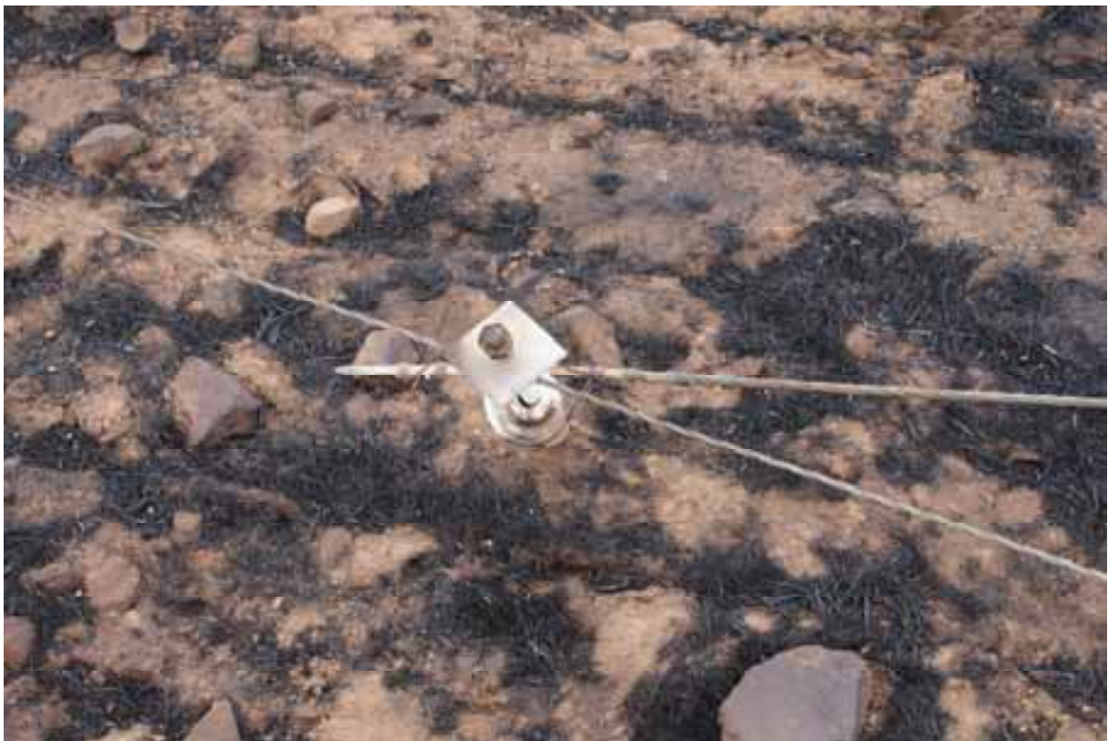
Broken earth return conductor near pole T303-43 (between poles T303-43 and T303-44). Photograph taken by EnergySafety on 30 December 2009