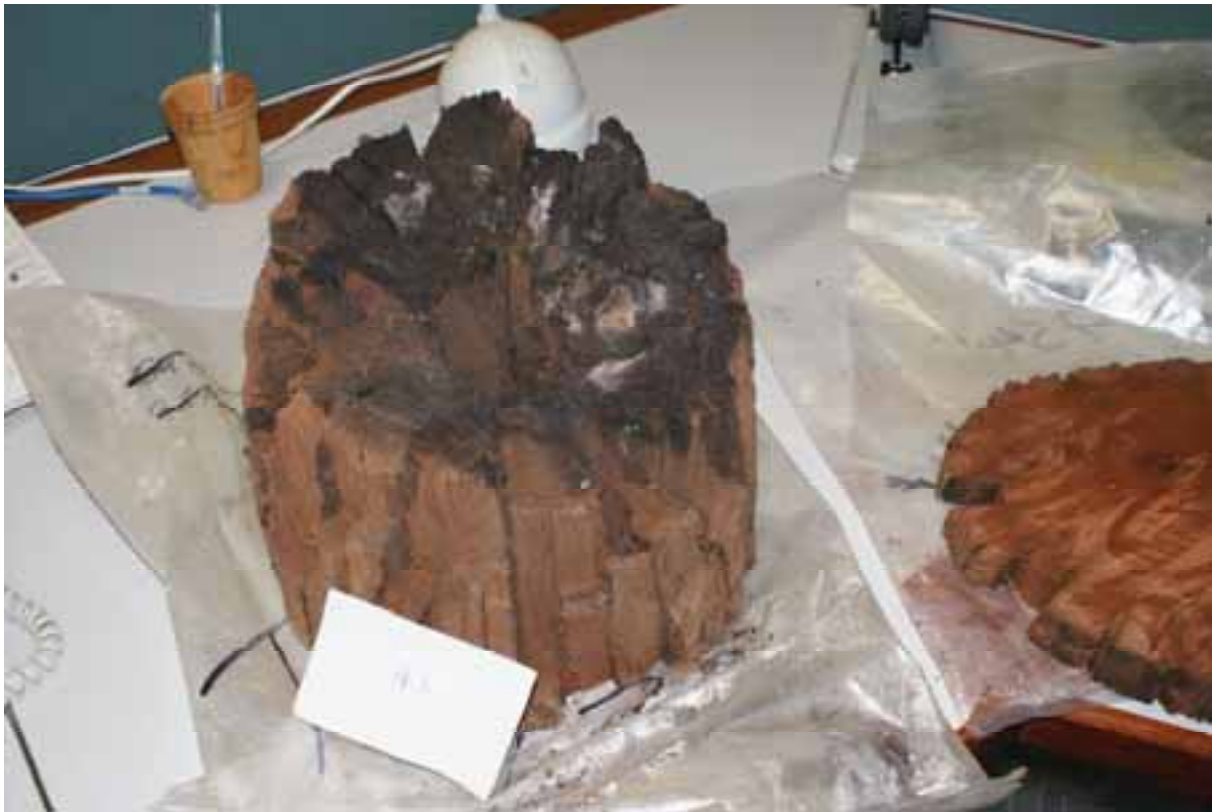
Top of pole Butt T303-43

Western Power, after removing the pole butts from the ground engaged the Forest Products Commission to examine the cut sample cross sectional slices from the two butts.