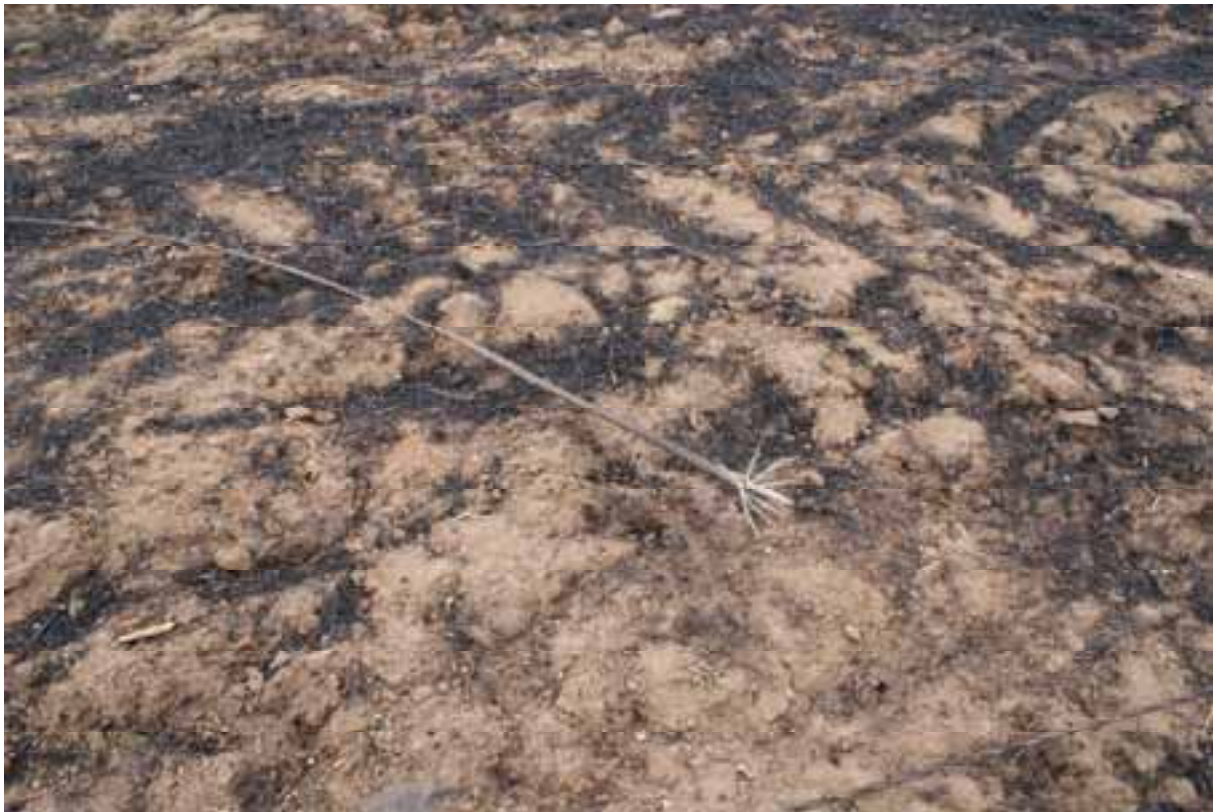
Broken earth return conductor near pole T303-43 (between poles T303-42 and T303-43). Photograph taken by EnergySafety on 30 December 2009