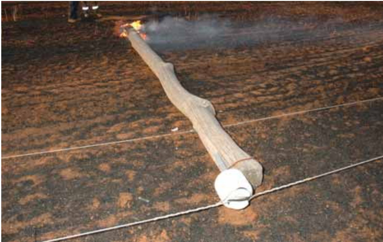
Pole T303-42. Photograph taken by FESA on 29 December 2009

Investigation concluded that Pole T303-42 eventually burnt through near the ground and then fell towards the ground. The fire consumed all except for the top of the pole.