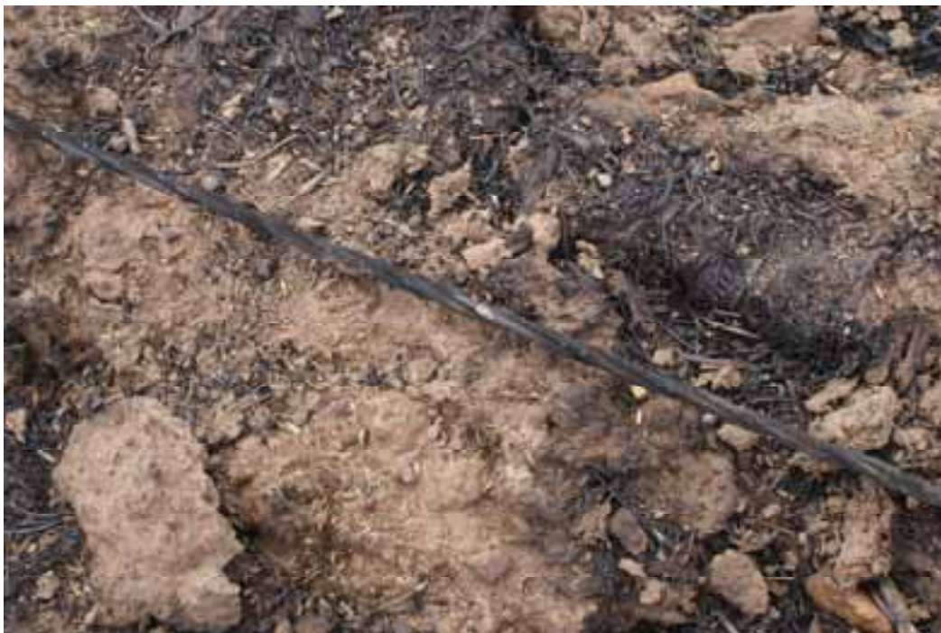
Arc Marks at 9 Metres.

The arc marks were analysed and found to be consistent with either the conductors clashing or some conductive object causing a short circuit between the two conductors. It has not been possible to determine the cause of these marks. The marks 14 metres from pole T303-43 were made recently because their surface had not begun to rust or corrode (the arc melting had removed the protective galvanising).